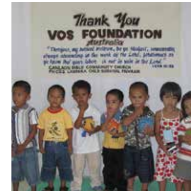
CANLAON, PHILIPPINES Some of the children who have benefited from our sponsorship of the early child- hood development program