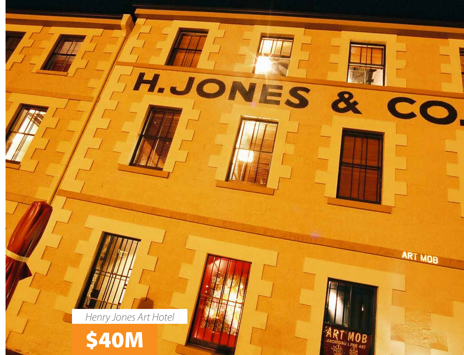
Henry Jones Art Hotel

As well as design and construct projects, we also are able to review a client's existing plans with a view to value add and improve their concepts by utilising the skills learnt from over forty years in the construction business.