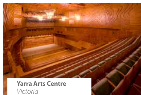
Yarra Arts Centre Victoria