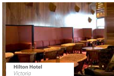
Hilton Hotel Victoria

Work has successfully been undertaken ranging from straightforward commercial fit-outs, such as bars, reception counters and joinery projects to prestigious and complex apartment, office and shop fit-outs throughout Australia.