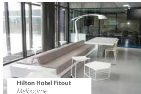
Hilton Hotel Fitout Melbourne

VOS Construction & Joinery is a nation-wide joinery and shop fit-out specialist, which, for the past 60 years has built an excellent local and interstate reputation for delivering quality detail joinery and efficient reliable service.