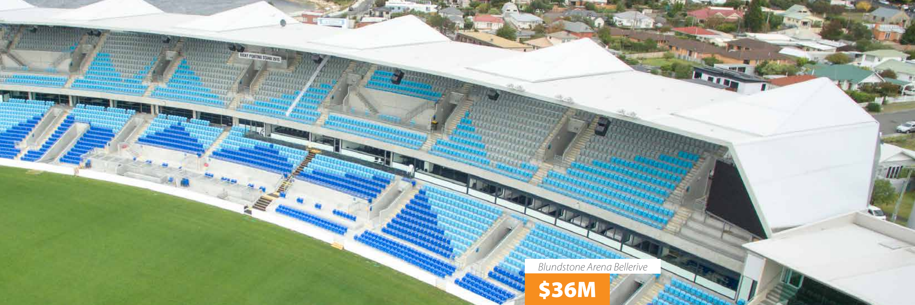
Blundstone Arena Bellerive